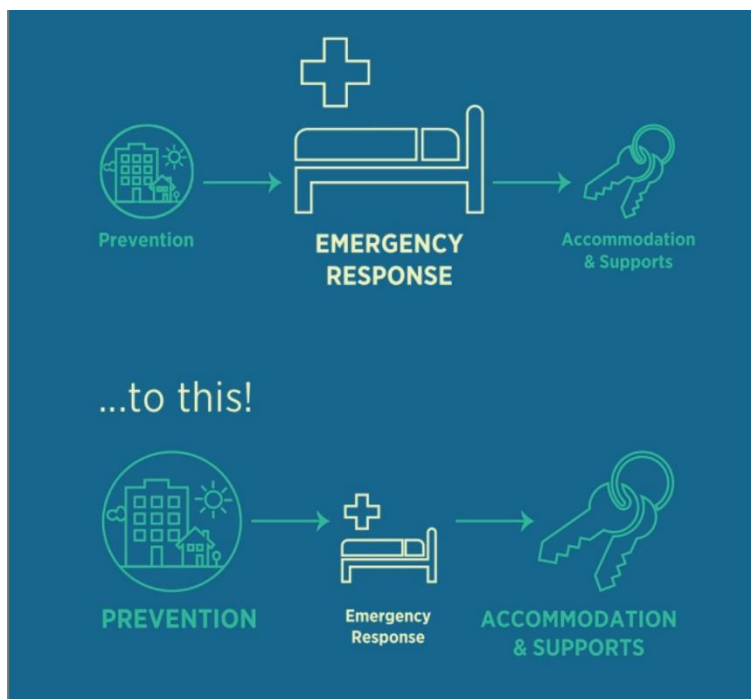
Figure 2: Representing the change in emphasis from emergency response to one of support and prevention.

emphasis on emergency response to one of prevention and accommodation support, as illustrated in Figure 2. Work has focused on stabilising the supply of TA through leased accommodation and the OYO contract, to enable resource to be diverted to prevention and move on.